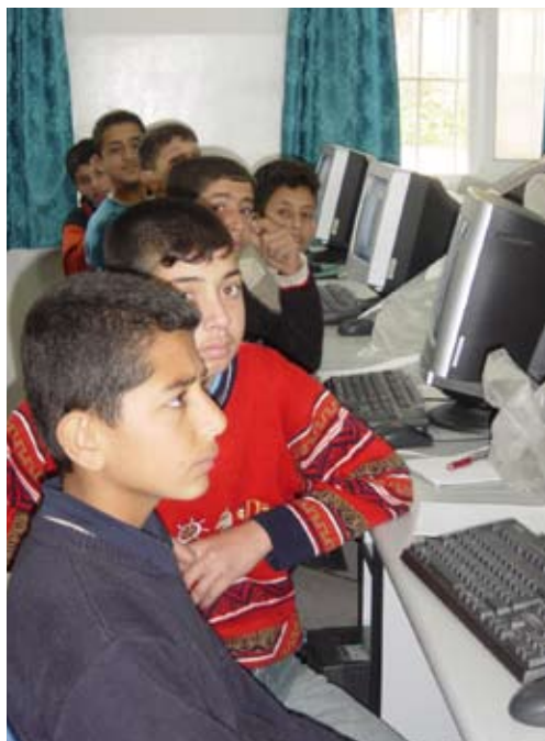
Palestine.